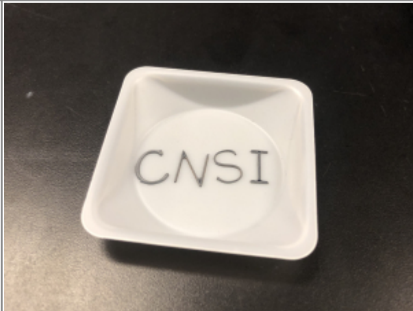
Whole pieces cut from wafer