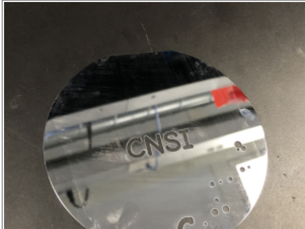
Contour cut in 0.5mm SI wafer