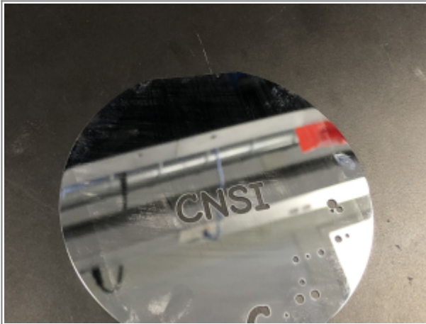
Contour cut in 0.5mm SI wafer