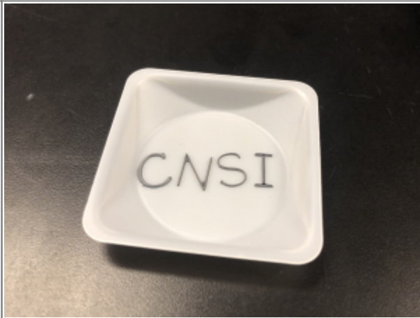
Whole pieces cut from wafer