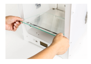
Open the front build plate clamps to insert the glass plate. Make sure the glass plate slides into the rear clamps and close the front clamps.