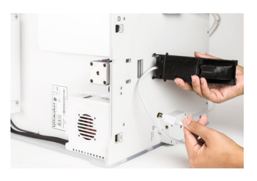
Gently place the printer on its side. Insert the spool holder into the back panel and push until it snaps into place.