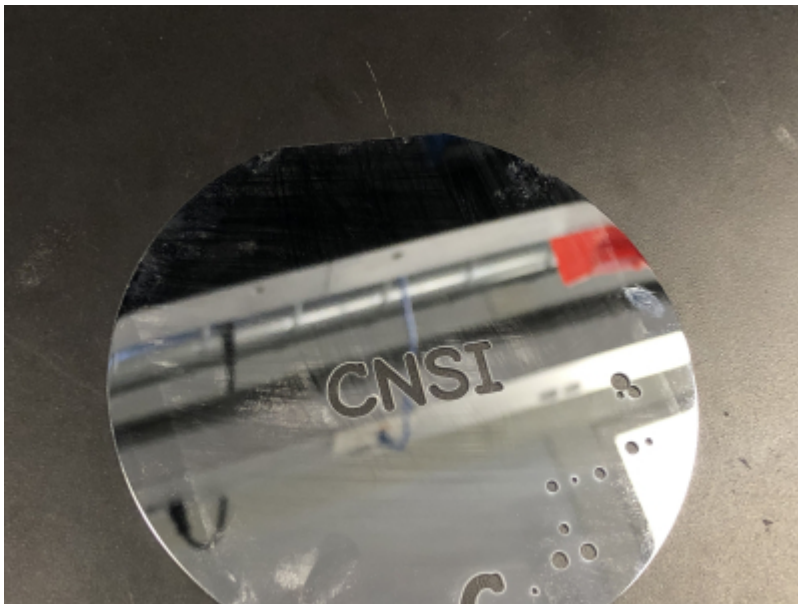
Demo contour cut in 0.5mm SI wafer